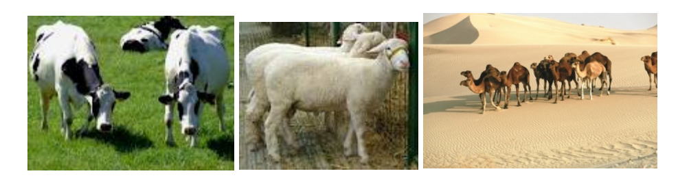
Cattle – Cows, Sheep and Camels